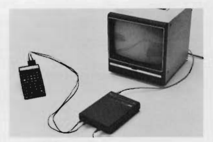
Note: The system's operation may be disrupted when the loop is disconnected.